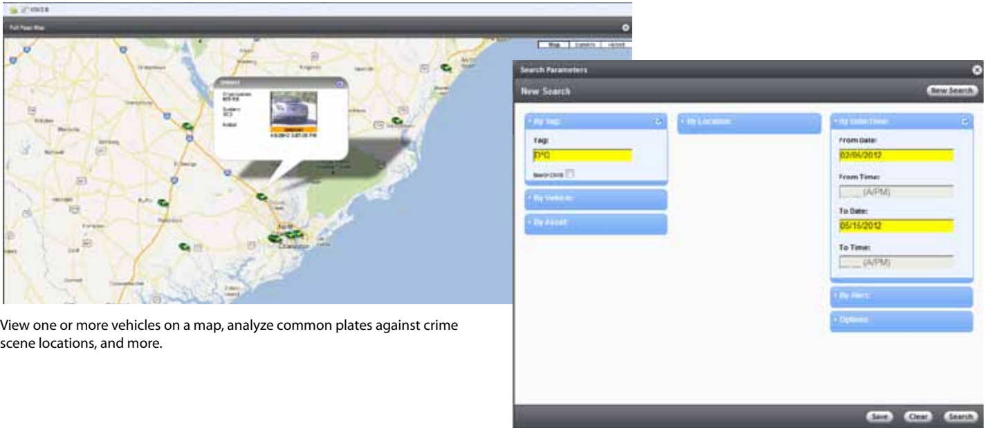
View one or more vehicles on a map, analyze common plates against crime scene locations, and more.

Serious about ANPR. Serious about Service.